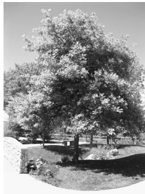
Swamp White Oak

Silver or Soft Maple Red Maple Serviceberry River Birch Hackberry Autumn Purple Ash Poplar Swamp White Oak Willow Arborvitae American Linden