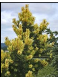
Taylor's sunburst a yellow-tipped lodgepole pine.